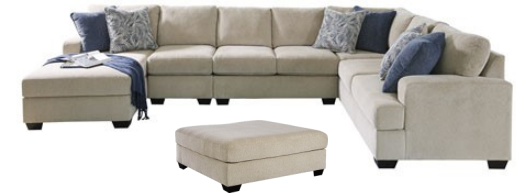
"Put your feet up"