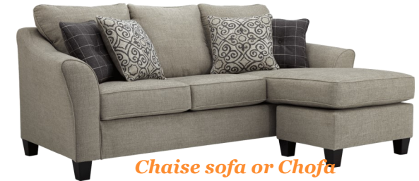
Chaise sofa or Chofa