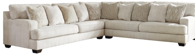
Big deep sectional