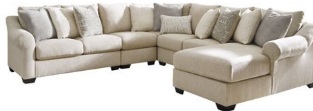
"Yes, all the pillows are included"